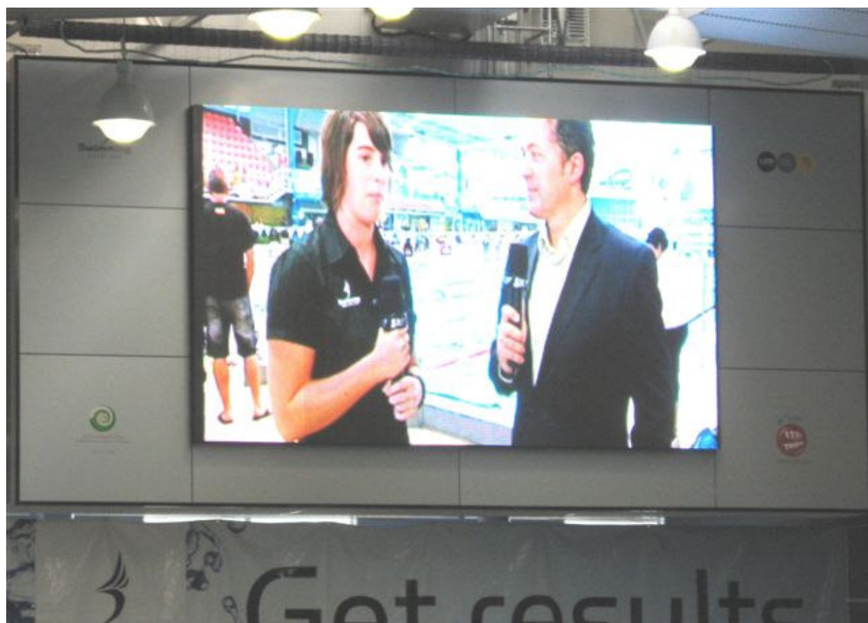
Commentators at Olympic Trials 2008