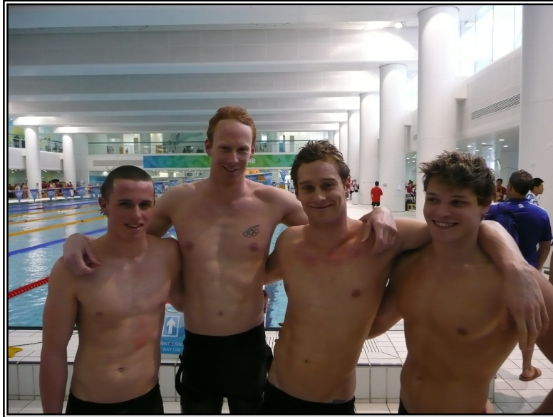
Olympic Finalists Medley Relay from left